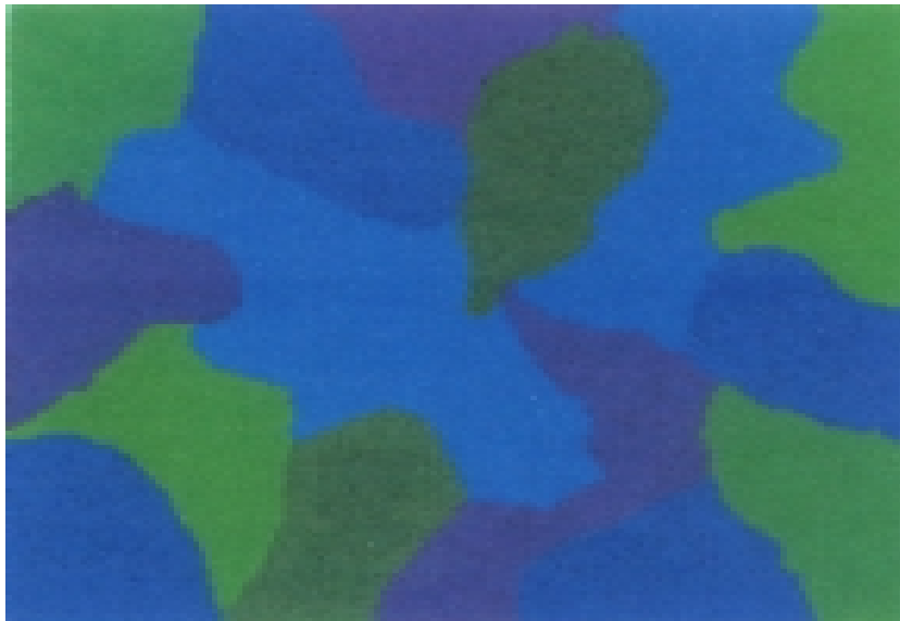
Illustration 2-1 Lower level using cool colors